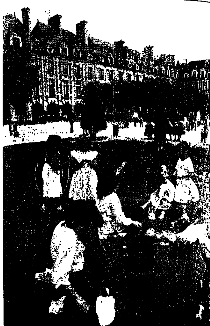
Exercise in perspective... La Placé des Vosges

Forthcoming recitals of Beethoven sonatas by Maurizio Pollini at the Salle Pleyel in Paris: January 20, February 12, April 20, May 15 and June 10